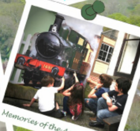
Memories of the Age of Steam