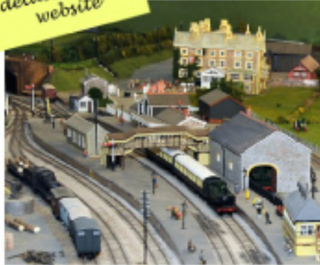
Working Model of Dulverton Station

Trains run on certain days - details on the website