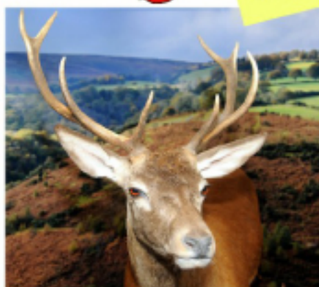
Red Deer Exhibition

A place to enjoy whatever the Exmoor weather!