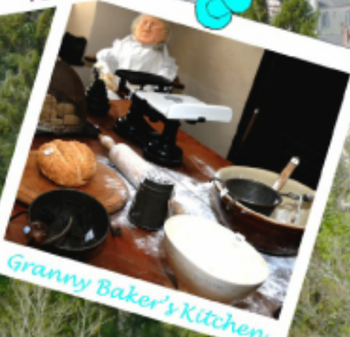
Granny Baker's Kitchen

Programme of art and craft exhibitions - see website