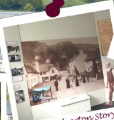
The Dulverton Story