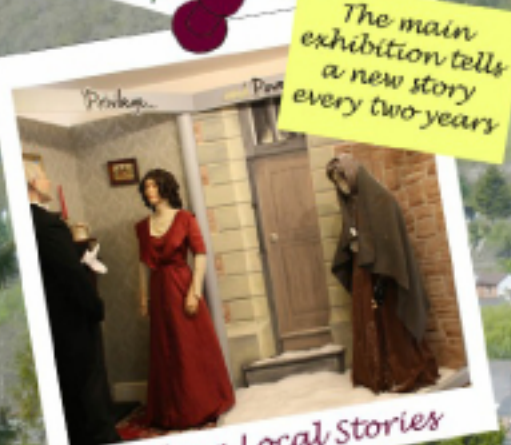
Telling Local Stories

The main exhibition tells a new story every two years